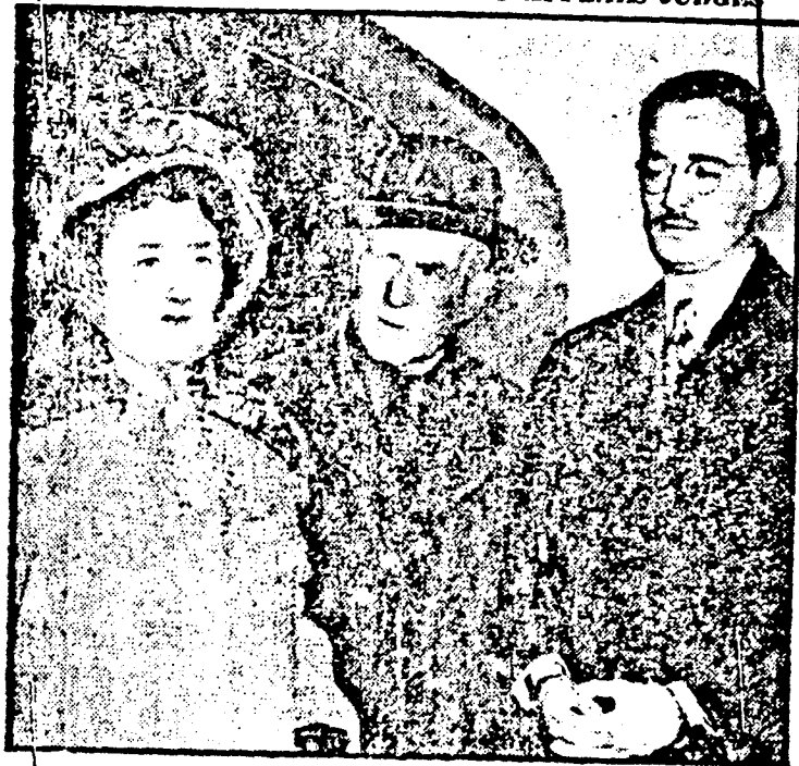
Julius Rosenberg and his wife, Ethel, flanking deputy marshal, yesterday lost their fight to escape electric chair when U. S. Court of Appeals reaffirmed death penalty imposed on them.